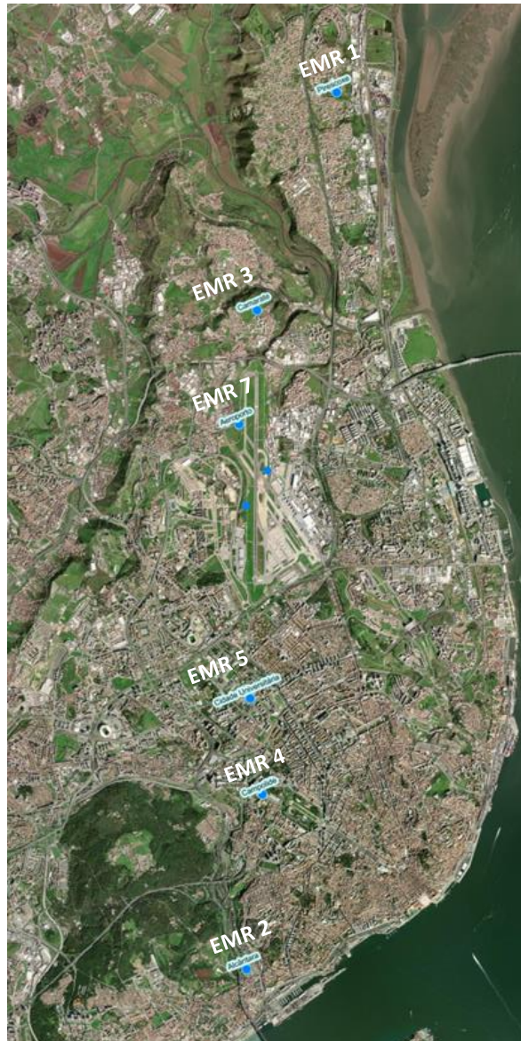
Figura 2 - Localização das EMR's

In the Noise Monitoring Terminals mentioned above, the noise values were collected and then compared to the simulated values for the same locations.